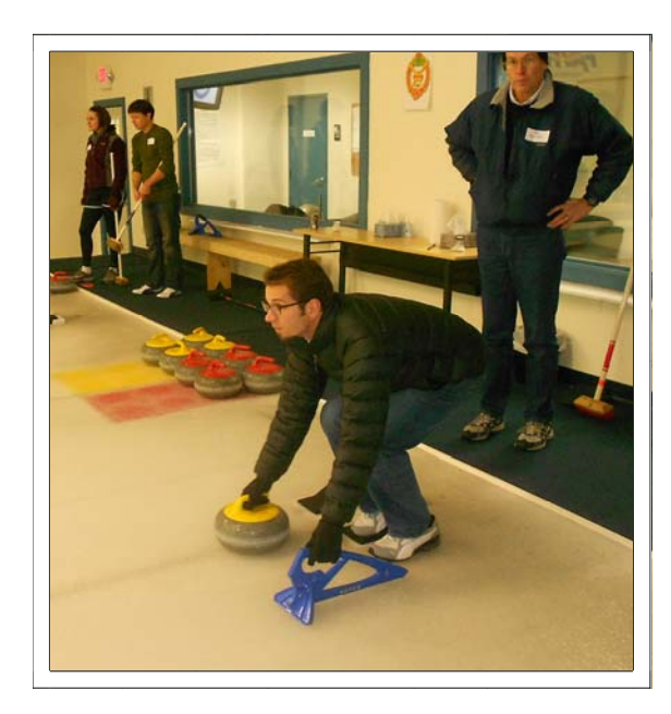
Delivering the Stone