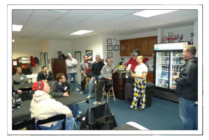
Relaxing in the "Warm House" Post Curling

In one of the more unusual ASHE social events ever held, more than 20 brave souls showed up at the Columbus Curling Center (Silver Drive near I-71 and Weber Road) to receive an introduction to curling. We are glad to report that no known casualties were reported. Everyone got to learn and try the four positions—the thrower, the sweepers, and the skip. The ice actually is pebbled, which is achieved by spraying the ice with a special device before play (still plenty slippery though!) Everyone had fun delivering the stone to the house!