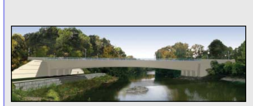
Dodridge Street Bridge Rendering

The Central Ohio Section is responsible for the section of I-670 adjacent to Grandview Avenue. The first event is tentatively scheduled for April. Stay tuned for more details !