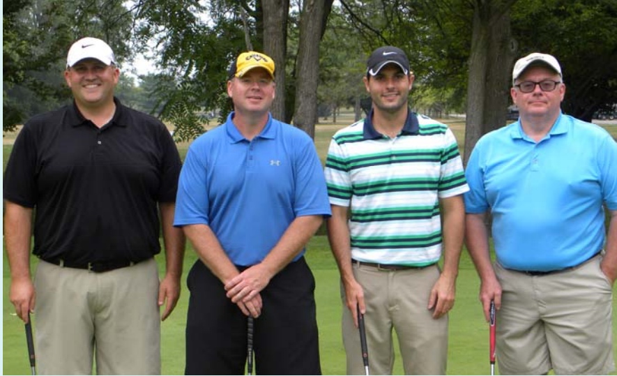
Congratulations to the winning team pictured above!