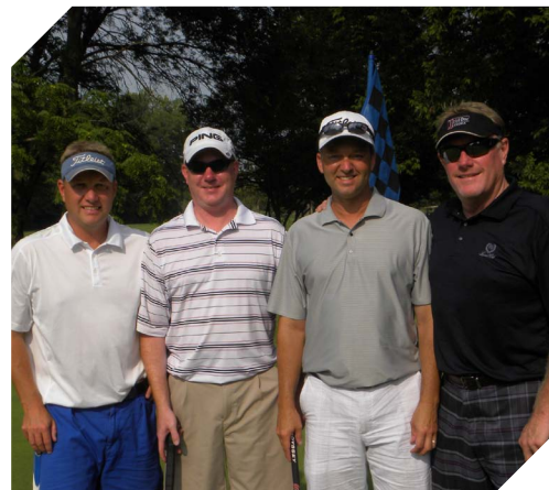
2013 Winning Team