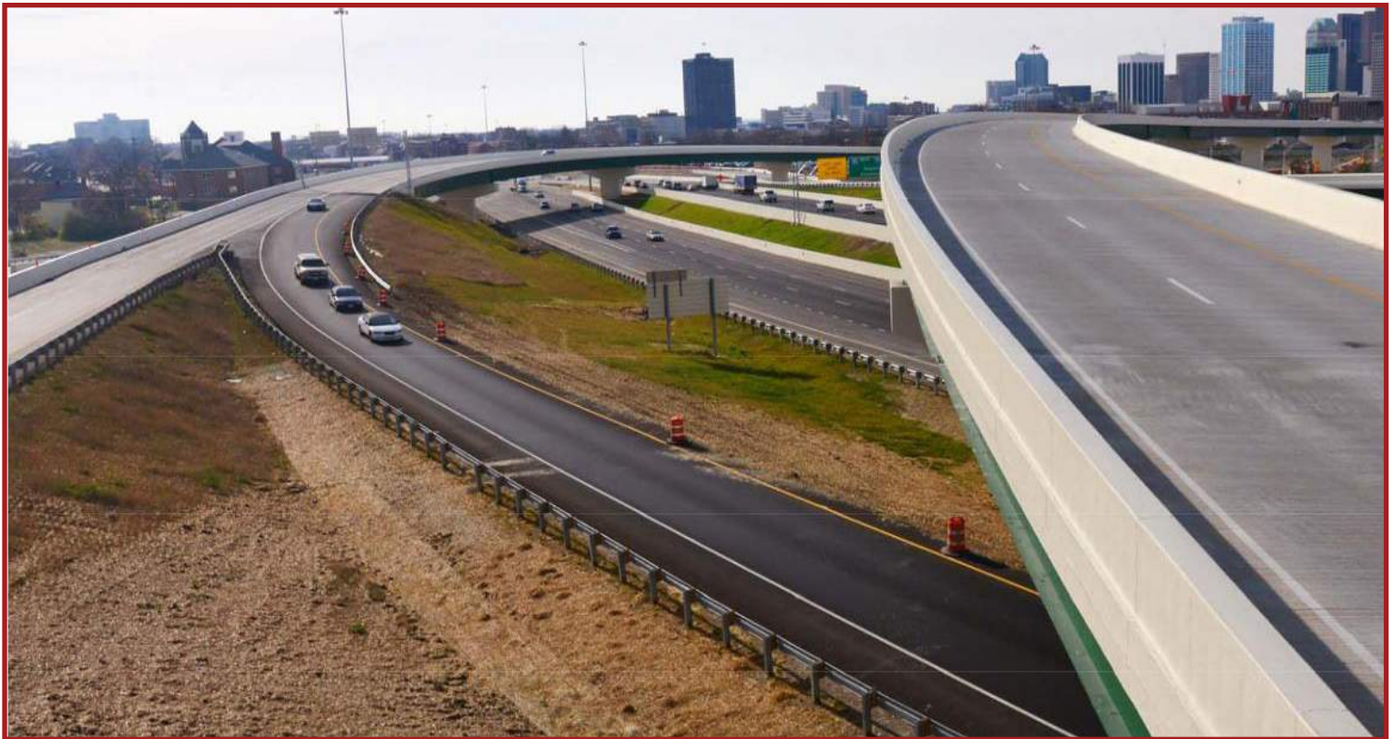
The Crossroads Project