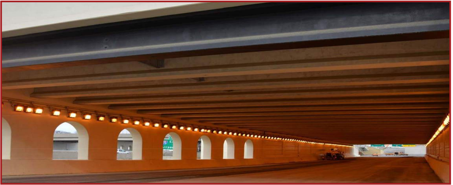
The Crossroads Project