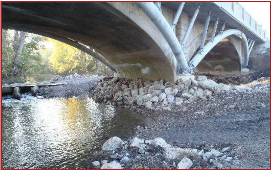
The Lithopolis Project