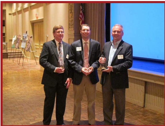
The Crossroads Project Winners