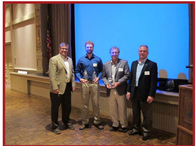
The Lithopolis Project Winners