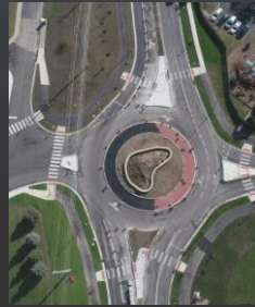
Scioto Darby & Leppert Rd Burgess & Niple