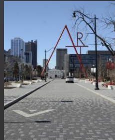
Creative Campus Phase 1 DLZ