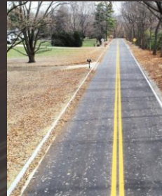
Thoburn Rd Franklin County