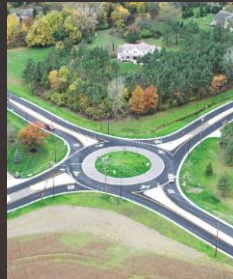
Smothers Rd at Schott Rd AECOM