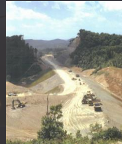
S OH Veterans Memorial Hwy ms consultants