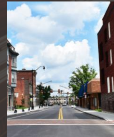
Parsons Ave Woolpert